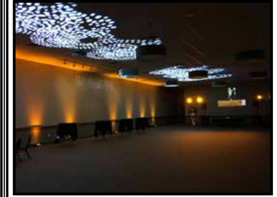
We can do a larger light show with uplighting and music video projection. This show utilized a neutral wall, but we can do up to 20 foot screens!