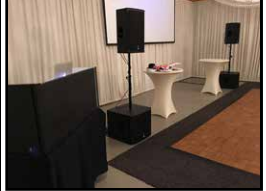
One of our simple sound systems without lighting.