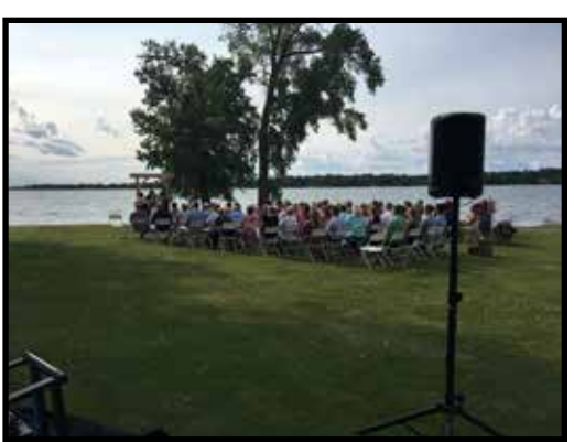
Wedding ceremonies at the lake, out in a hay field, or anywhere without electricity!