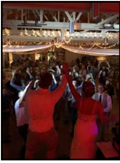
It is great to see over half the guests still there to close the party!