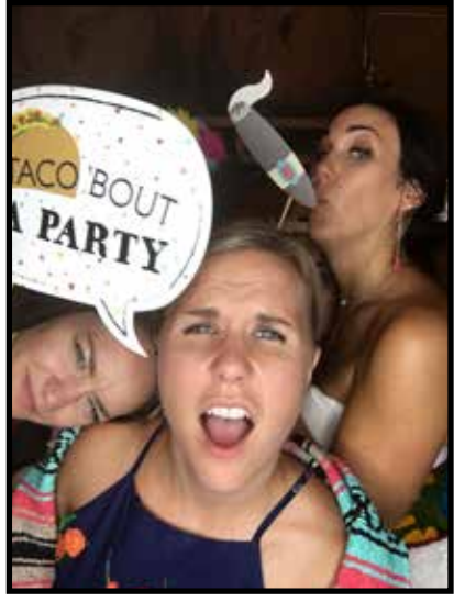
A shot from the selfie booth with party props. Images are sent right to the guest's cell phone for social media posting.