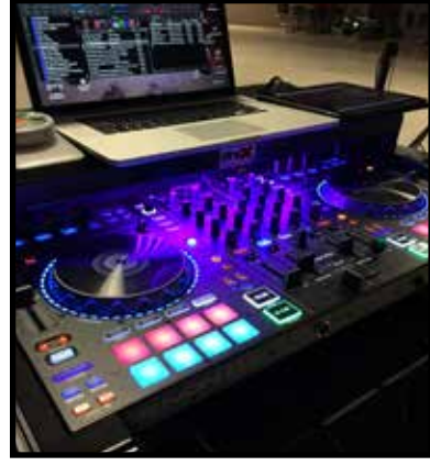
Some of the tools of our trade!