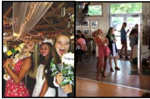
I love this shot! Two images taken at the same time of and from the Selfie Booth!